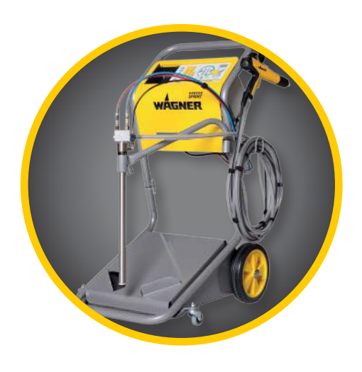
Maximum flexibility The WAGNER Sprint X manual unit allows working alternately with the Tribo lance and Corona manual gun PEM-X1.